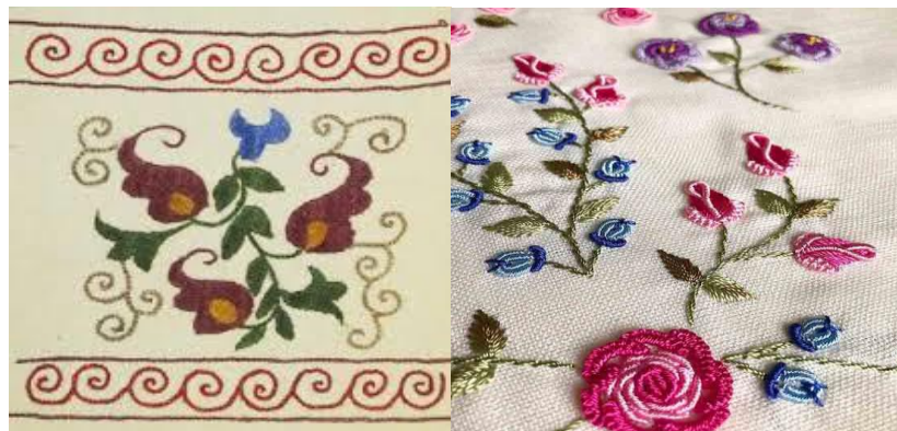
Embroidery bet tools and devices

Embroidery - various in color silk, mulina, zar yarn with needle, looped in us each different to the cloth flower is a bet. Embroidery each different clothes, food items is sewn. In embroidery fabric, felt, leather, cardboard, linen, wool, silk, artificial threads, dice threads, fine wire, raw leather prepared ribbons, beads, necklaces, metal pulakcha, expensive natural and artificial stones, glass made beads and another materials is used. In embroidery to himself special the work weapons there is they are to himself special task performs In embroidery needles, looped and without a hook braids, knots, angishvona, scissors and belts is used.